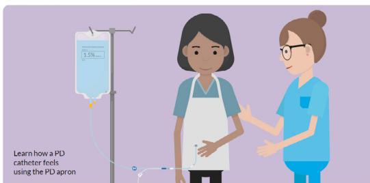
Learn how a PD catheter feels using the PD apron